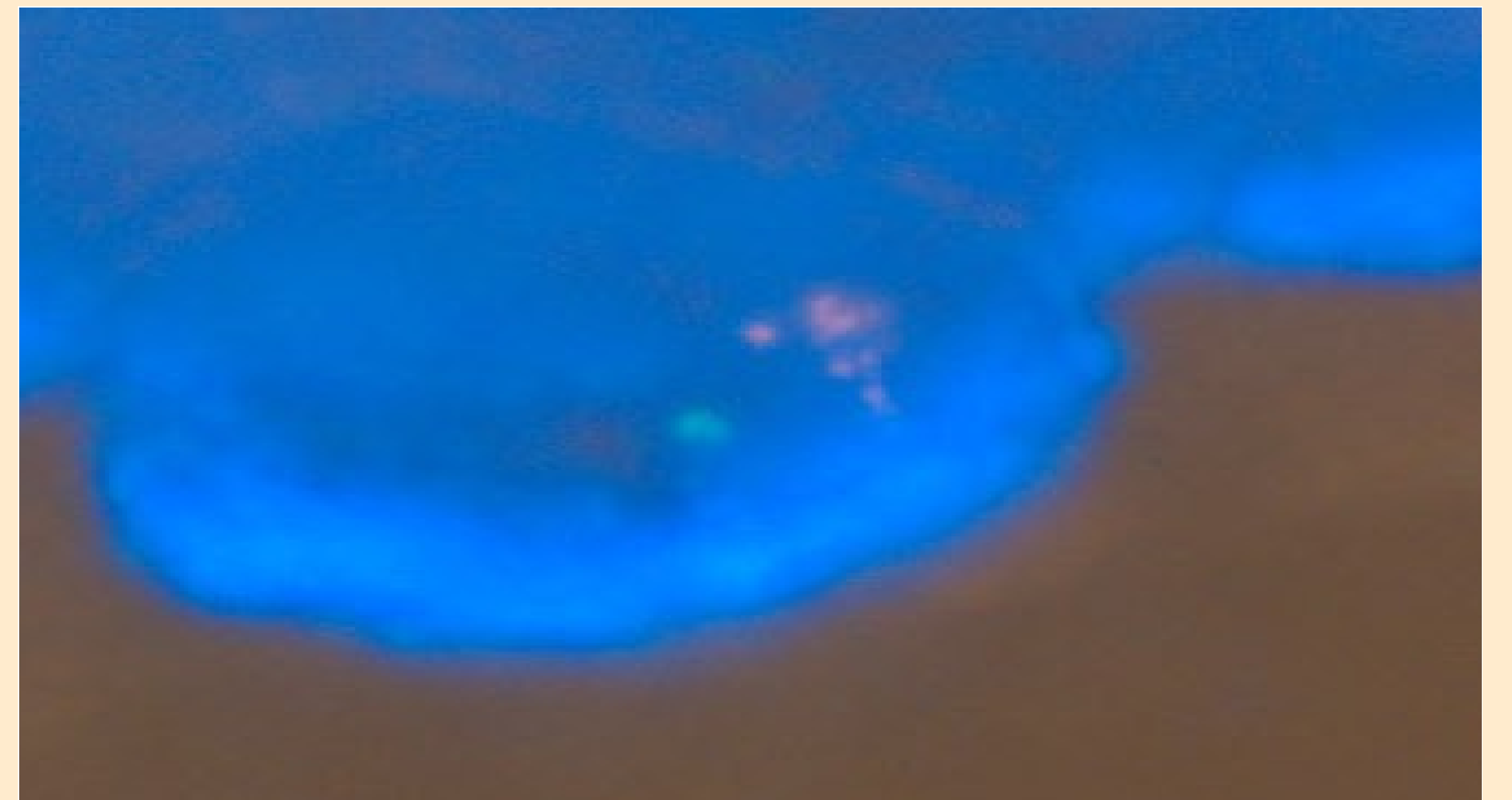
A case showing mdm2 gene amplification

Of the 46 cases, 12 (26%) showed mdm2 amplification. Mdm2 nuclear positivity was seen in 19 cases (41%) and was very minimal in proportion with only one case having 100% of mdm2 nuclear expressions. There was no correlation between mdm2 gene amplification and mdm2 nuclear expressions. Cytoplasmic positivity, however, was observed in 29 cases (63%), and, interestingly, this staining pattern was seen more frequently in amplified cases (11 cases, 92%) than in non-amplified cases (18 cases, 55%). Therefore, we were able to demonstrate a strong correlation between mdm2 cytoplasmic expressions and mdm2 gene amplification ( p=0.0005 ).